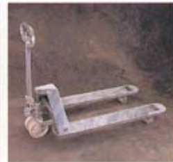
Freezer Truck – A special design features anti-corrosion materials for wet, cold and other harsh environments.