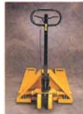
Dual-Action Drum Brake – Increases maneuverability and operator safety on uneven floors.