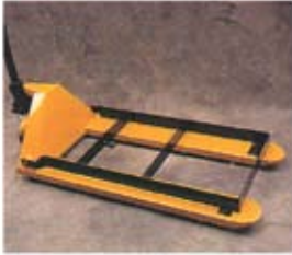
Skid Adaptor – Transforms the truck for either pallet or skid use. Secures easily in a vertical position.