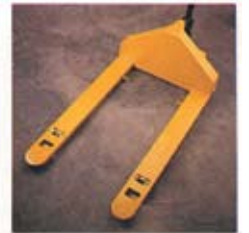
Four Way Hand Pallet Truck with Pallet Stops – Operator can handle pallets easily in all four directions. Maximizes trailer load density while restricting fork entry in adjoining pallets.