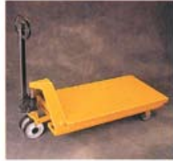
Platform/Skid Truck – Offers a customized solution to various unique applications.