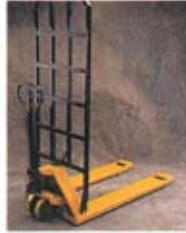
Load Backrest – Built from 1 1/4" tubular steel for added load stability and operator safety.