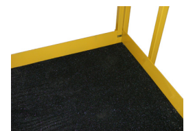
TRACTION GRIP FLOOR