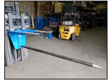
INVERTED FORK MOUNT