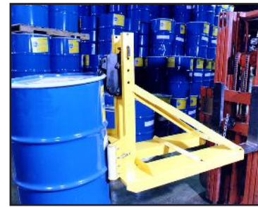
EG3SCM-NF 1 Drum - Narrow Fork Mount