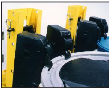
EG4DCM2-F 2 Drum - Double Clamp