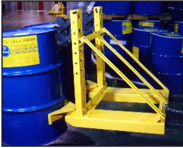
EG1SCM2-F Fixed 2 Drum Single Clamp