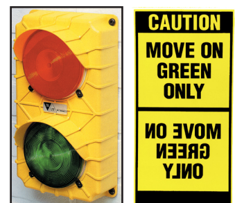
Exterior Light System/Signs