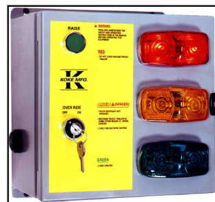
Control Panel/Interior Light System

Controls are mounted in a NEMA 4 gasketed, weather resistant control box. Components and wiring are UL listed/recognized. Requires 110VAC/1PH power. Other power configurations available.